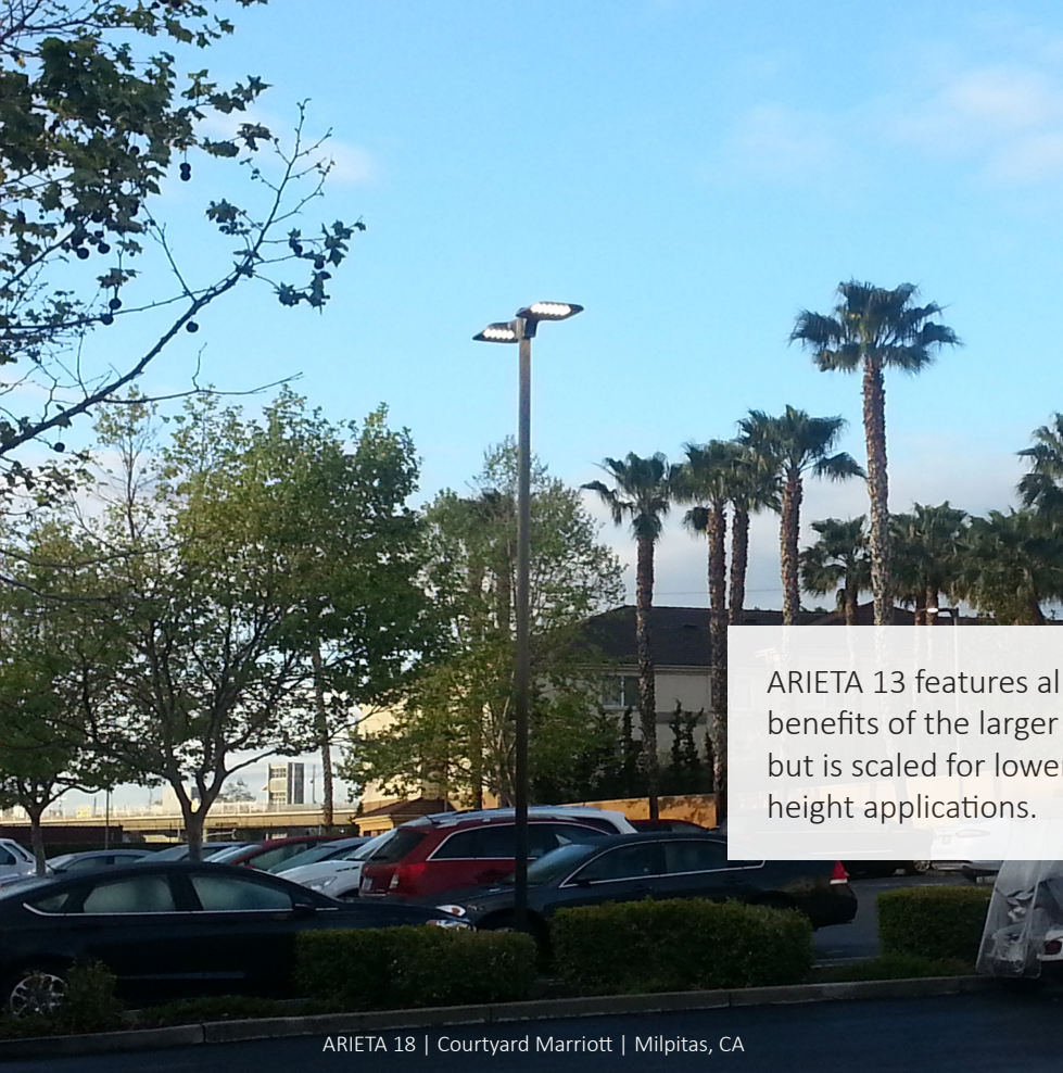
ARIETA 18 | Courtyard Marriott | Milpitas, CA

ARIETA 13 features all the benefits of the larger ARIETA 18 but is scaled for lower mounting height applications.