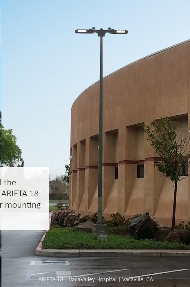
ARIETA 18 | VacaValley Hospital | Vacaville, CA

ARIETA 13 features all the benefits of the larger ARIETA 18 but is scaled for lower mounting height applications.